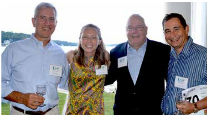
Three Cheers for the Honorees!