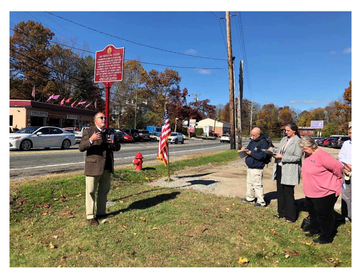
Roxbury Township Mayor Bob Defillippo addresses crowd at Lake Hopatcong Station historic marker dedication.